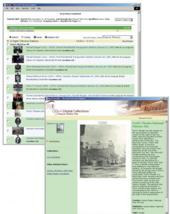
BROWSE SEARCH RESULTS WITH AUTOMATIC THUMBNAILS THEN CLICK TO VIEW THE FULL RECORD DISPLAY.