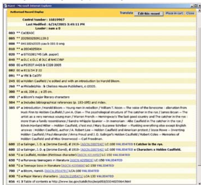
3. Authorize records via online interactive authority control, instantly matching and updating bibliographic headings to authoritative forms.